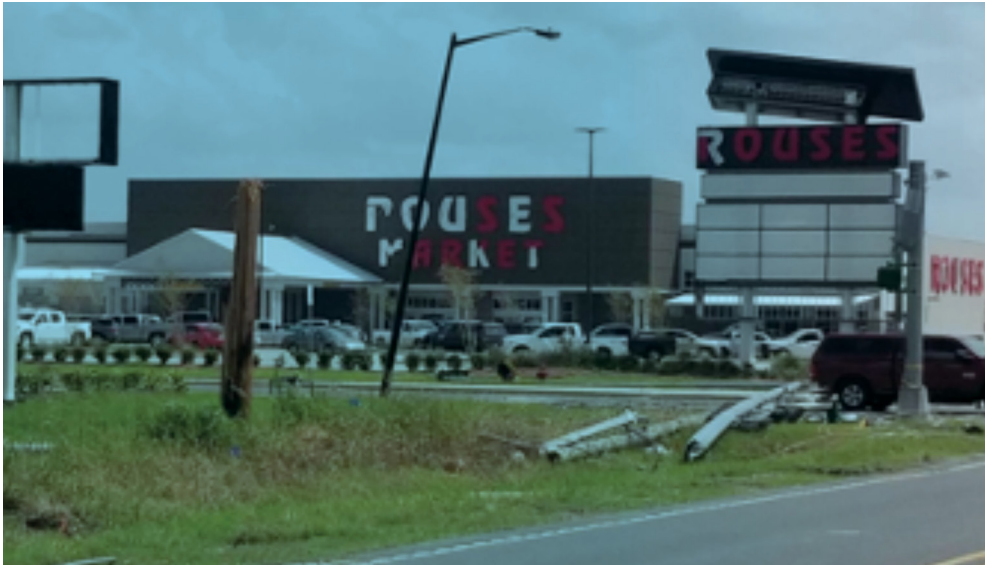
Figure 3. Shoppers buying essential supplies one week after landfall, while the local utility still had no power. Storm structure damage and debris can be seen on the right. Click here to watch a video about PowerSecure’s work with Rouses Market.

In terms of the economic benefit stemming from microgrid power, neither store experienced the loss of produce that a utility power outage would have caused. After the initial storm cleanup was done, customers were able to shop for essential items like ice, water, food, baby formula, supplies and medicines, providing a much-needed lifeline to the community. The stores also proved to be of critical value for first responders, utility linemen and other essential service personnel working in the area with no other source to obtain essential supplies.